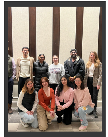
UConn DDI Fellows